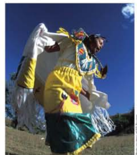
Cultural events, such as powwows, feature Lakota dancers in handmade regalia.