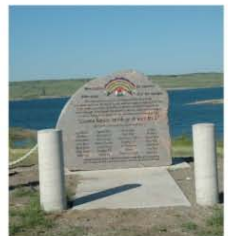
Travelers can visit repatriation monuments honoring individuals who were displaced by the construction of the Oahe Dam on the Missouri River.