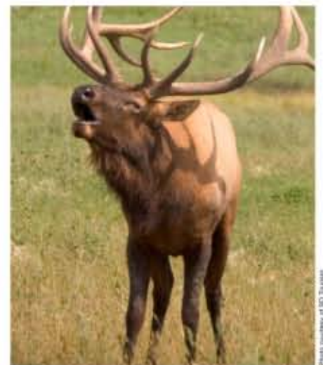
Visitors to the Reservation can take part in wildlife tours to view buffalo, elk and wild horses.