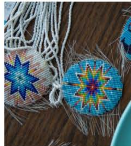
Locally made, authentic Lakota art is found in area stores and gift shops.