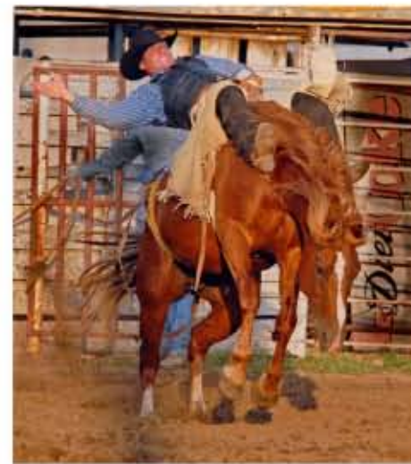
Western events, such as rodeos, are held throughout the summer months.